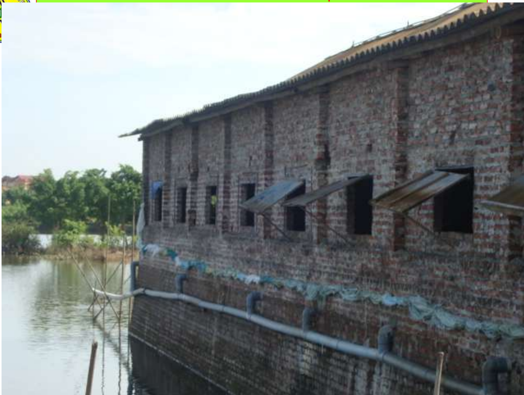
An Giang, 16-18 Nov