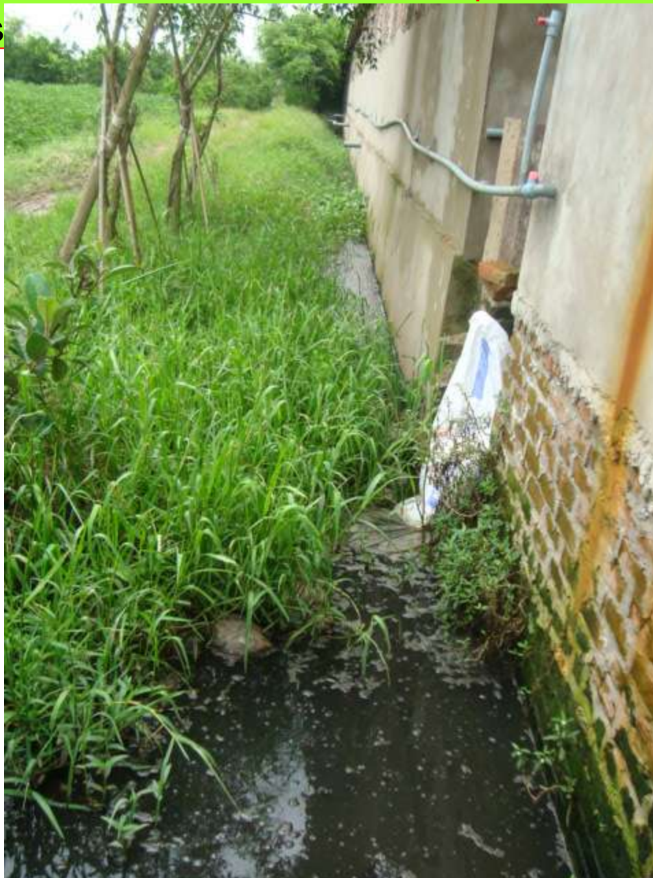
An Giang, 16-18 Nov